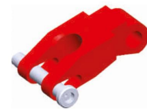
Pneumatic Backsaver Adapter Figure No. 34