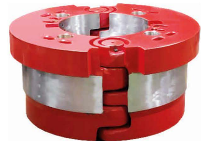
Master Bushing for EMSCO RT Model : ABMB 3750-E Figure No. 3

Master Bushing is supplied alongwith the following :