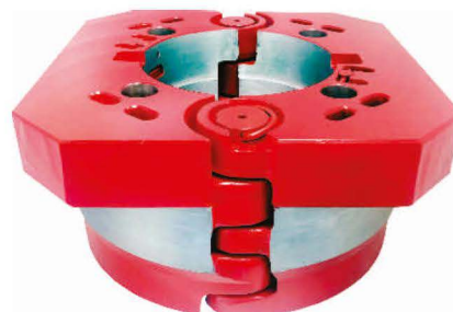
Master Bushing for Oilwell RT Model : ABMB 3750-SQ Figure No. 2