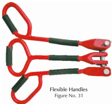
Flexible Handles Figure No. 31