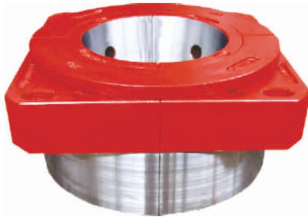
27.1/2" Split Casing Bushing Figure No. 12

Casing Bushings are available in either solid or split types, and all variants can accommodate bowls of different sizes to cater to a wide range of casing dimensions. They are directly installed into the Rotary Table, and by using CMS-XL or CP-S slips, the casing string can be easily rotated during cementing operations. Casing Bushings are designed to handle string loads of up to 500 tons.