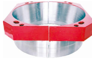
Split Casing Bushing for 37.1/2"-49.1/2" Oilwell RT Figure No. 13