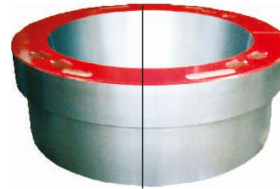
Split Casing Bushing for 37.1/2"-49.1/2" National RT Figure No. 15